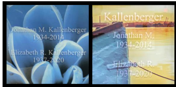
Inscriptions engraved on the glass niche front.