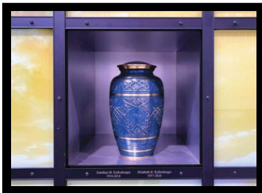
Inscriptions engraved on the aluminum extrusion.