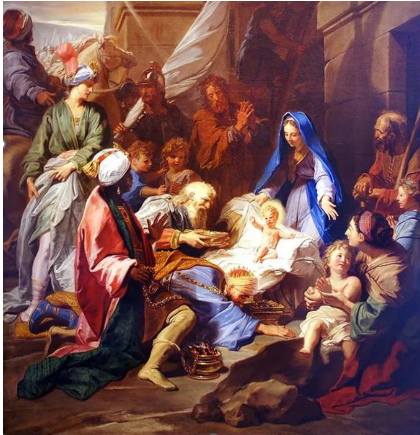
Adoration of the Magi by Jean Jouvenet (1644-1717)

“When we understand the true gift coming to us at Christmas, then we have found our reason to Rejoice!”