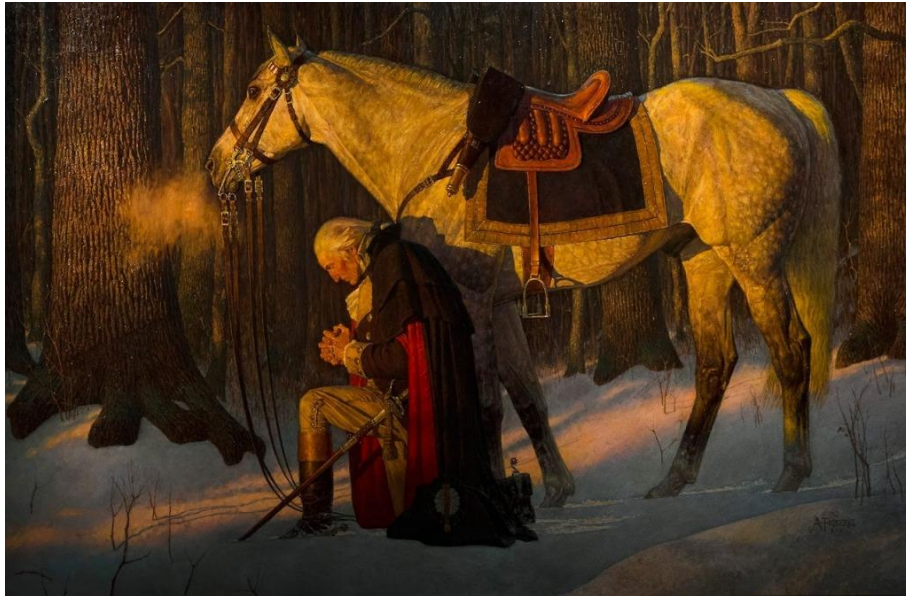
The Prayer at Valley Forge (Arnold Friberg, 1976)

My dear Deacon Brothers, Men in Formation, Wives and Widows,