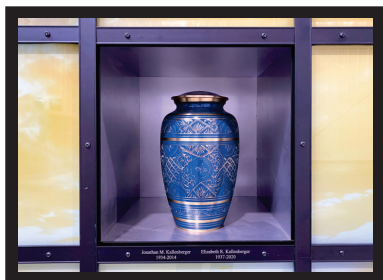
Inscriptions engraved on the aluminum extrusion.