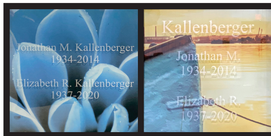
Inscriptions engraved on the glass niche front.