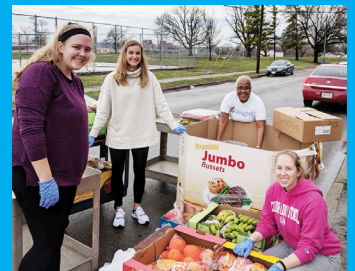
CATHOLIC SOCIAL SERVICES