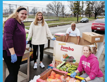
CATHOLIC SOCIAL SERVICES