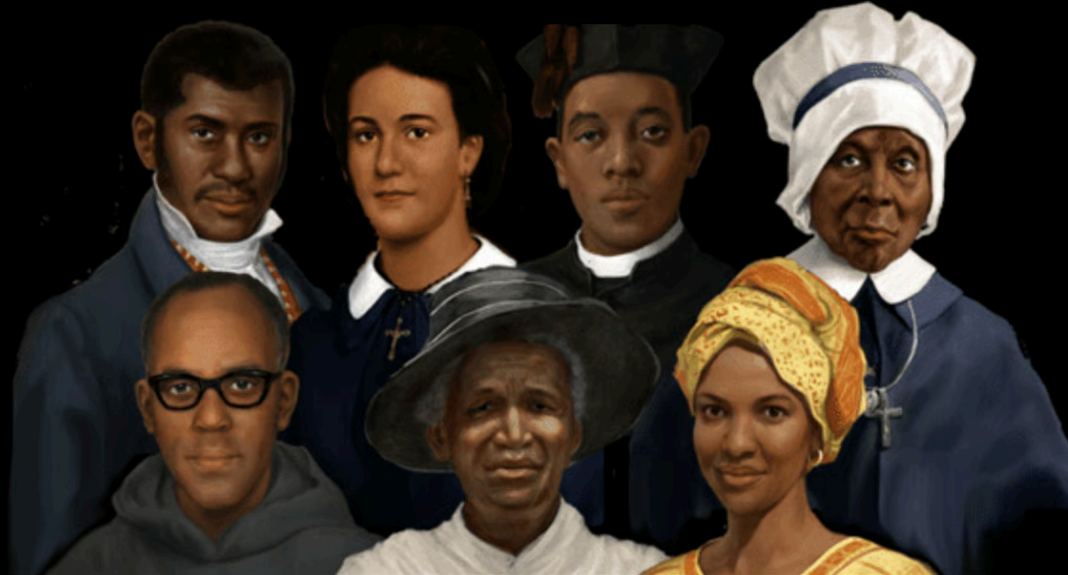
Back row: Venerable Pierre Toussaint, Venerable Henriette DeLille, Father Augustus Tolton, Servant of God Mother Mary Elizabeth Lange Front Row: Friar Martin De Porres Maria Ward, Servant of God Julia Greeley, Servant of God Sister Thea Bowman